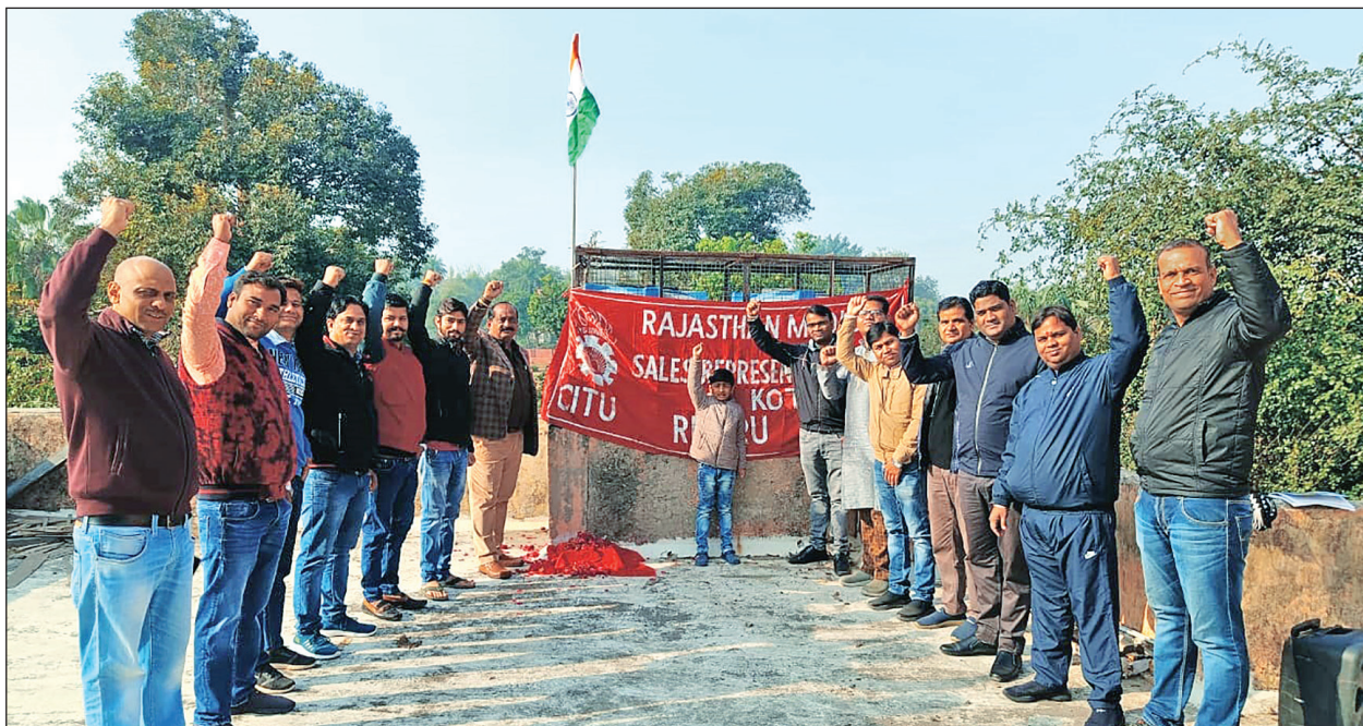
■ Republic Day observation in Kota Rajasthan