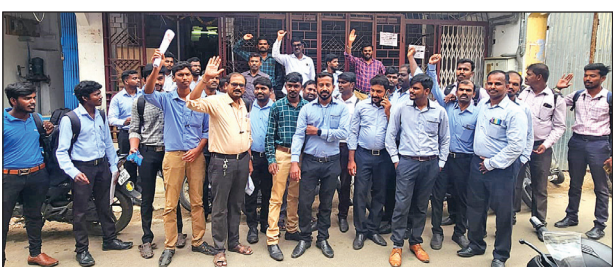
Strike programme at Tirunelvelli