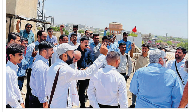
CITU Foundation Day observed by CGSPEU