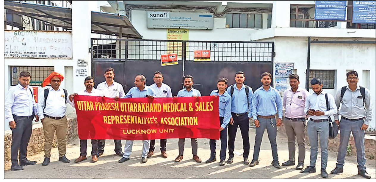
Demonstration by UPMSRA against Sanofi in Lucknow

60-A Charu Avenue ■ Kolkata 700 033 ■ Phone: (033) 24242862 ■ Fax: (033) 24244943 ■ www.fmrai.org ■ E-mail: fmrainews@gmail.com