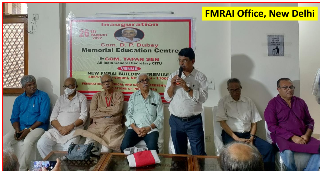
FMRAI Office, New Delhi