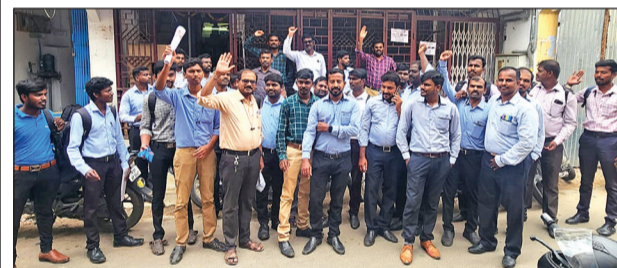
■ Strike programme at Tirunelveli