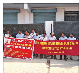
■ At Lucknow by UPMSRA

In a bold move, FMRAI organized the badge-wearing programme by the, Abbott SPEs, demonstrations and finally, a nationwide strike on May 22nd. Over 3000 field workers joined the protest, highlighting their grievances through a day-long strike and dharna outside Abbott offices. The strike was successful in all the state units of FMRAI as the SPEs working in Abbott choose to raise their protest by participating in the strike programmes. Day long Dharna and demonstrations were organised in front of Abbott health care establishments across the country. This collective action underscores the workers' resolve to challenge unfair treatment and demand justice. It serves as a stark reminder of the power of solidarity in the face of corporate injustice, signaling a movement for workers' rights and dignity in India.