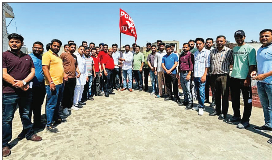
■ May Day observed by PCMSRU