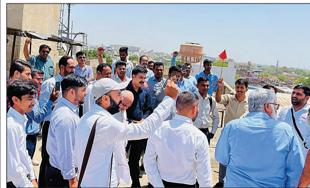
■ CITU Foundation Day observed by CGSPEU