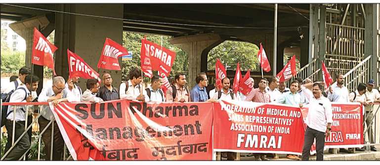
■ Demonstration against SPIL at Mumbai by MSMRA

the path of struggle. Now in 2023 the management has once again transferred eight MSR's to distant places, including three committee members. Furthermore, the management illegally stopped the increment violating the agreed understanding. Management has also unilaterally stopped the salary of the field workers, who opposed the same. Field workers are being forced to join the malpractices of unethical selling. In this backdrop a deputation team from