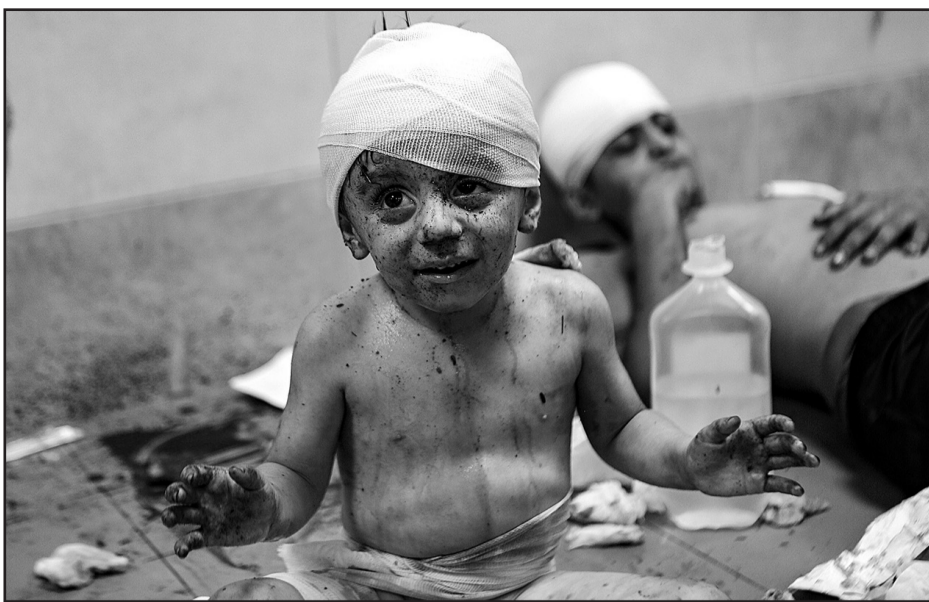
Children have been the worst victims in the recent Israeli aggression in Gaza

After a long and protracted persuasion Torrent management met with the All India council leadership in their head office. On 3rd October 2023, a delegation of members of Torrent All India council met with the management in deputation at Ahmedabad to submit the demand of the Torrent fieldworkers endorsed by signatures of 1600 field workers of Torrent across the country. Asst. General Manger (HR) received the deputation and discussion was held in a congenial atmosphere. Demand to constitute and convene the Grievance committee was the main focus of discussion. The management assured to place the demands of the field workers to the higher management and revert back