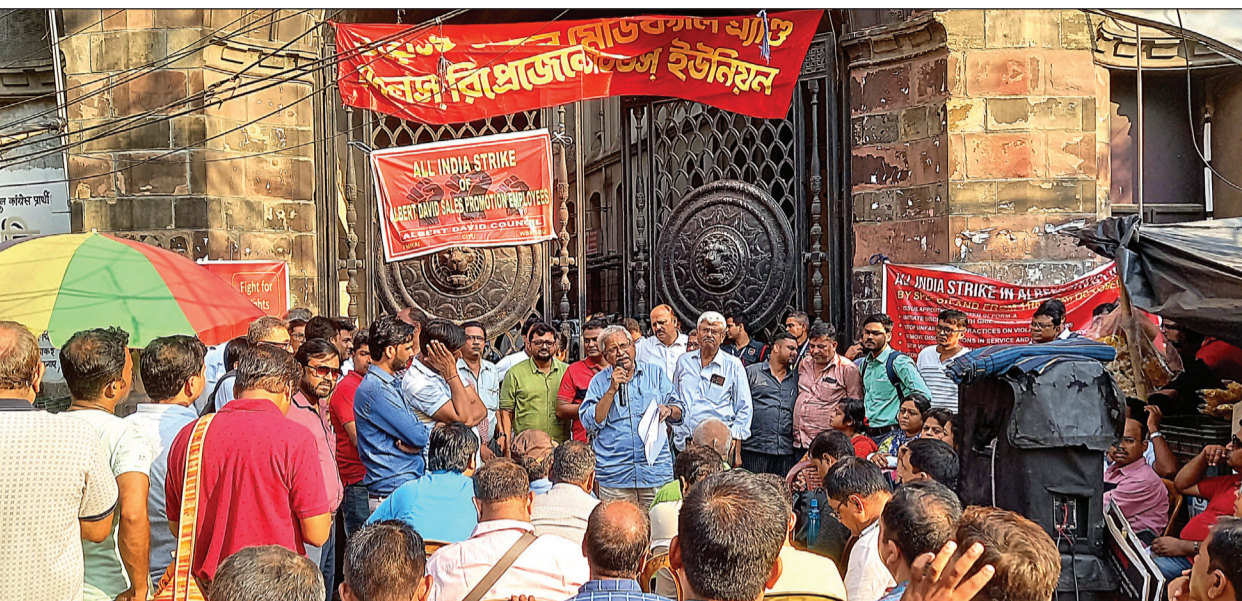
Trade Union leaders addressing Albert David dharna in front of company HO in Kolkata