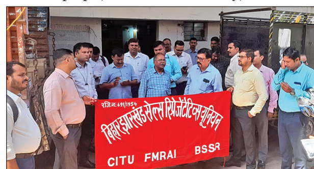
BSSRU organized demonstration at Patna