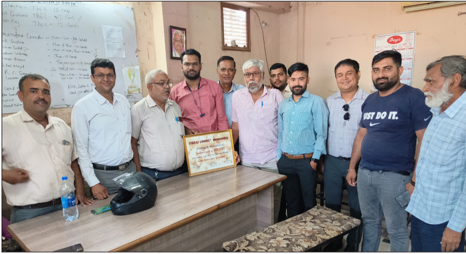
■ Celebrating 1000 membership by Jodhpur unit